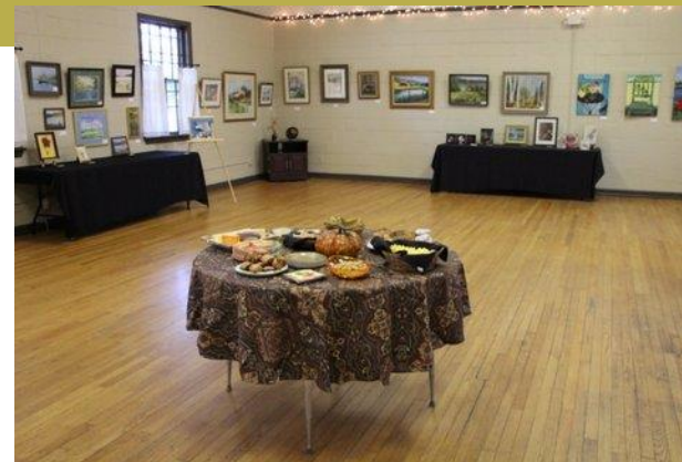
The upper level accommodates up to 100 people.

The upper level of the Parish House is a large 30'x50' room with a kitchenette and two ADA-compliant bathrooms. You are welcome to use our ten 8'foot folding tables, five 6' round tables and 60 chairs.